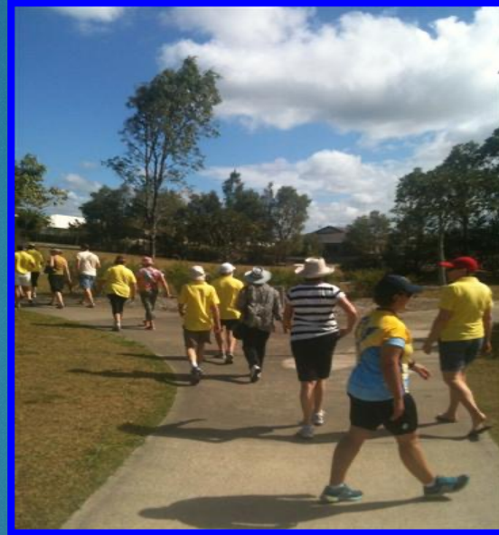
Picnic Canavan Gracie Park